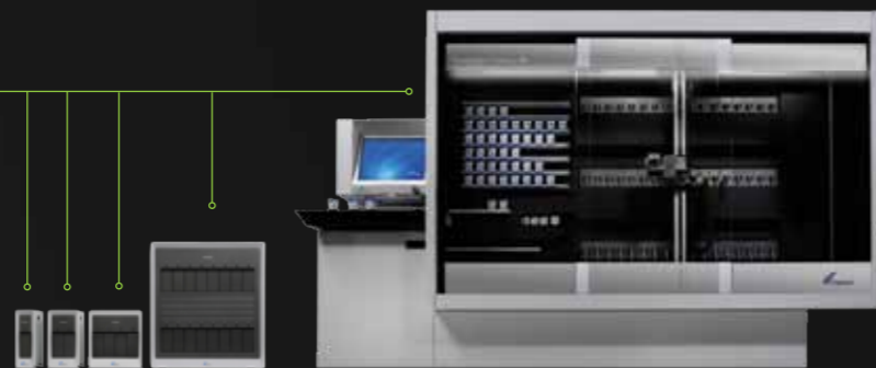
GeneXpert® I, II, IV, and XVI